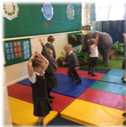
'Going for Gold with God'

We are very lucky to be part of this fantastic MAT.