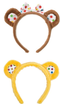
Blush or Pudsey Ears £2.50