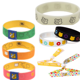
Selection of wristbands including the new coloured wristbands From £1.00