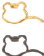
NEW Grey or Gold Pin Badges £1.00