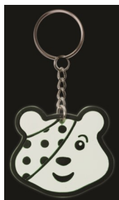
Pudsey Glow in the dark Keyrings £2.00

This year we will once again be supporting the BBC Children In Need Appeal at Great Wood. We will be selling 'Glow in the dark' key rings, Ears, wristbands and pin badges at the following prices,