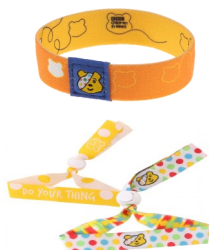
Selection of wristbands £1.00