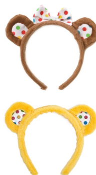
Blush or Pudsey Ears £2.50