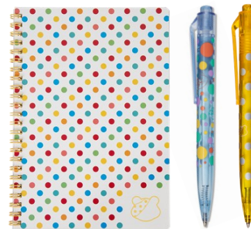
Pudsey Stationery Pens £1 Notepads £2