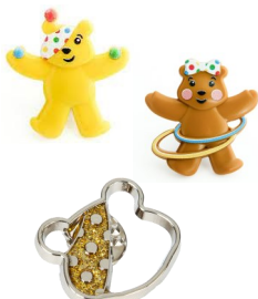
Selection of Pin Badges £1.00