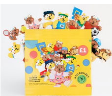
Pudsey Collectables £1.00

This year we will once again be supporting the BBC Children In Need Appeal at Great Wood. We will be selling wristbands, pin badges, Pudsey/Blush Ears and Stationery, at the following prices: