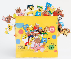
Pudsey Collectables £1.00

This year we will once again be supporting the BBC Children In Need Appeal at Great Wood. We will be selling wristbands, pin badges, Pudsey/Blush Ears and Stationery, at the following prices: