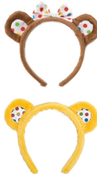
Blush or Pudsey Ears £2.50