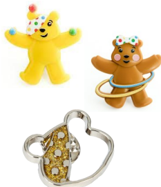
Selection of Pin Badges £1.00