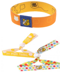
Selection of wristbands £1.00