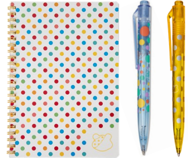
Pudsey Stationery Pens £1 Notepads £2

Our support for charitable causes is as a result of your generosity, however, we appreciate it may not always be easy to make contributions.