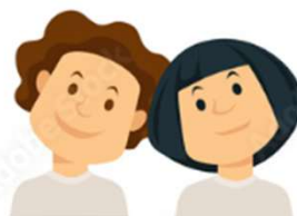
TOUCHING INFECTED HEAD