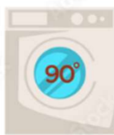
WASH CLOTHES AND BEDDING