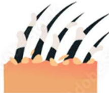
SORES AND SCABS