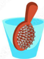
SOAK HAIR BRUSHES (90°)