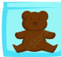
SEAL CLOTHES, BEDDING, AND PLUSH TOYS IN A PLASTIC BAG FOR TWO WEEKS