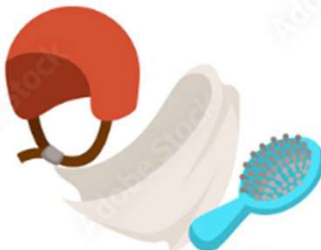
SHARING THE PERSONAL ITEMS